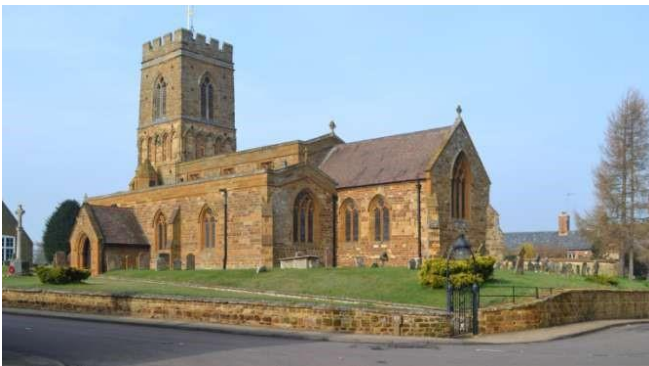
St Mary's Little Houghton.

To make known the love of God in each home through our faith We aim to develop a vibrant community through prayer, education, worship and fellowship.