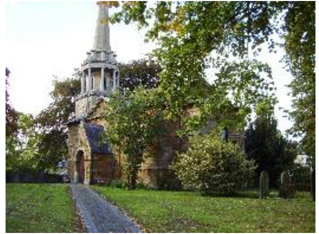
St Mary's Great Houghton

Sharing God's love and including all people in worship anywhere, anytime.