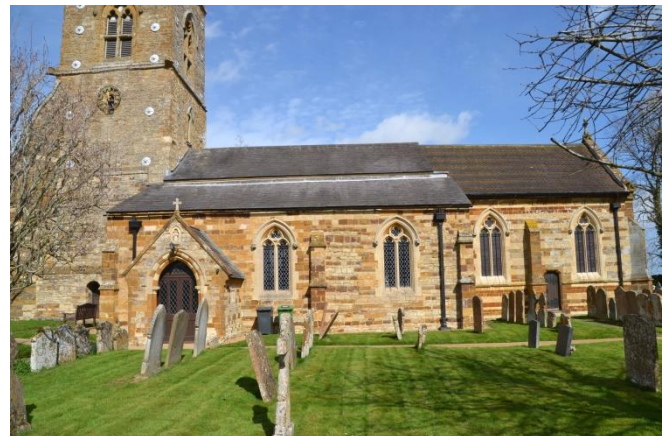
St Laurence, Brafield on the Green.

Keeping the Church at the heart of village life