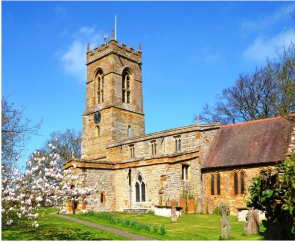
St Peter's Cogenhoe

Sharing God's love and including all people in worship anywhere, anytime.